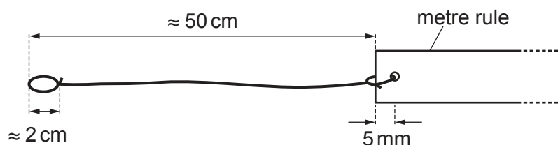
Fig. 1.1 (not to scale)

Tie one end of thick string through the hole and tie a loop at the other end of the string as shown in Fig. 1.1.